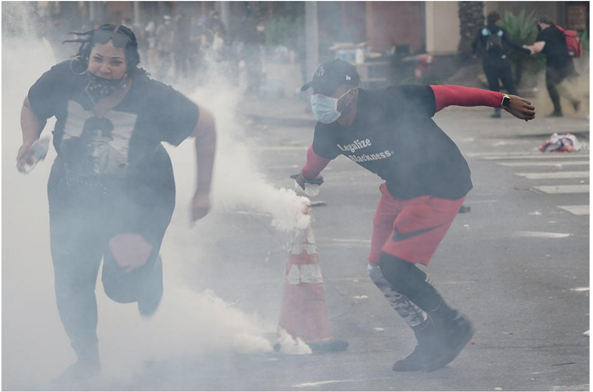
Beverly Hills: Two demonstrators flee as police throw tear gas into the crowd. (Bing Guan)