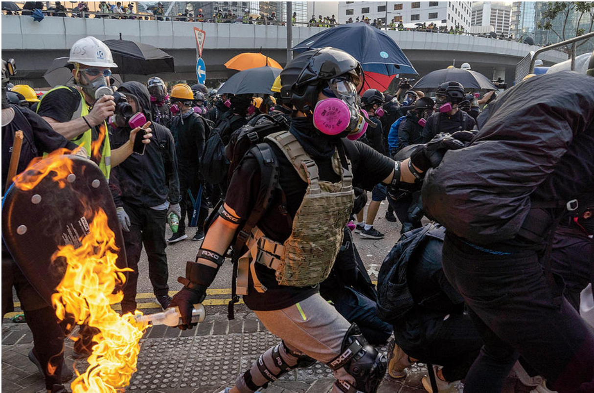
Hong Kong: An anti-government protester throws a Molotov cocktail at riot police.

“I never thought an uprising would happen like this in the United States. Our attention span with outrage tends to be very short,” says Guan. “It’s been amazing to see.”