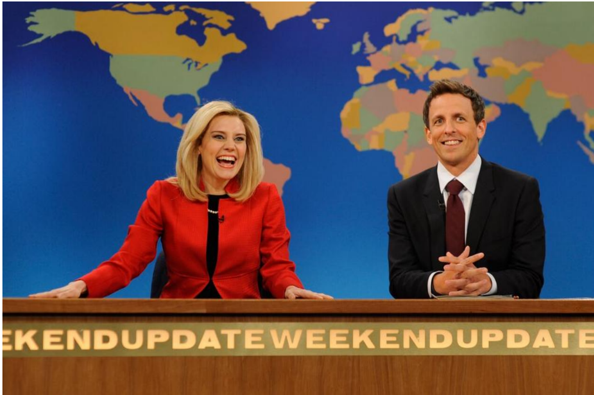
Kate McKinnon with Seth Meyers on "Saturday Night Live."