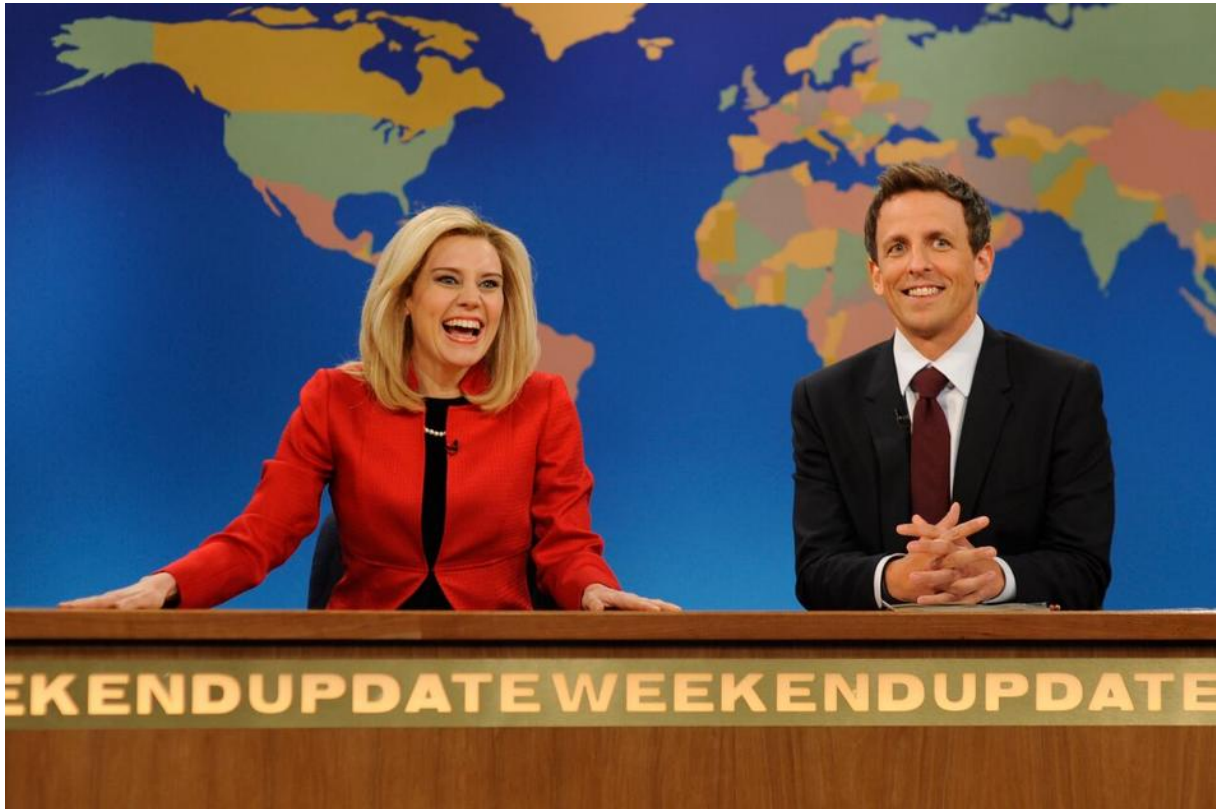
Kate McKinnon with Seth Meyers on "Saturday Night Live."