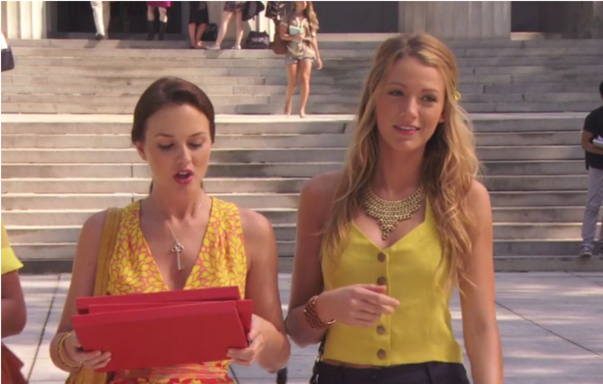
Leighton Meester and Blake Lively in "Gossip Girl," The CW.

Blair Waldorf (Leighton Meester), Serena van der Woodsen (Blake Lively), and Nate Archibald (Chace Crawford) all attend Columbia College in the 2007-2012 teen drama Gossip Girl .