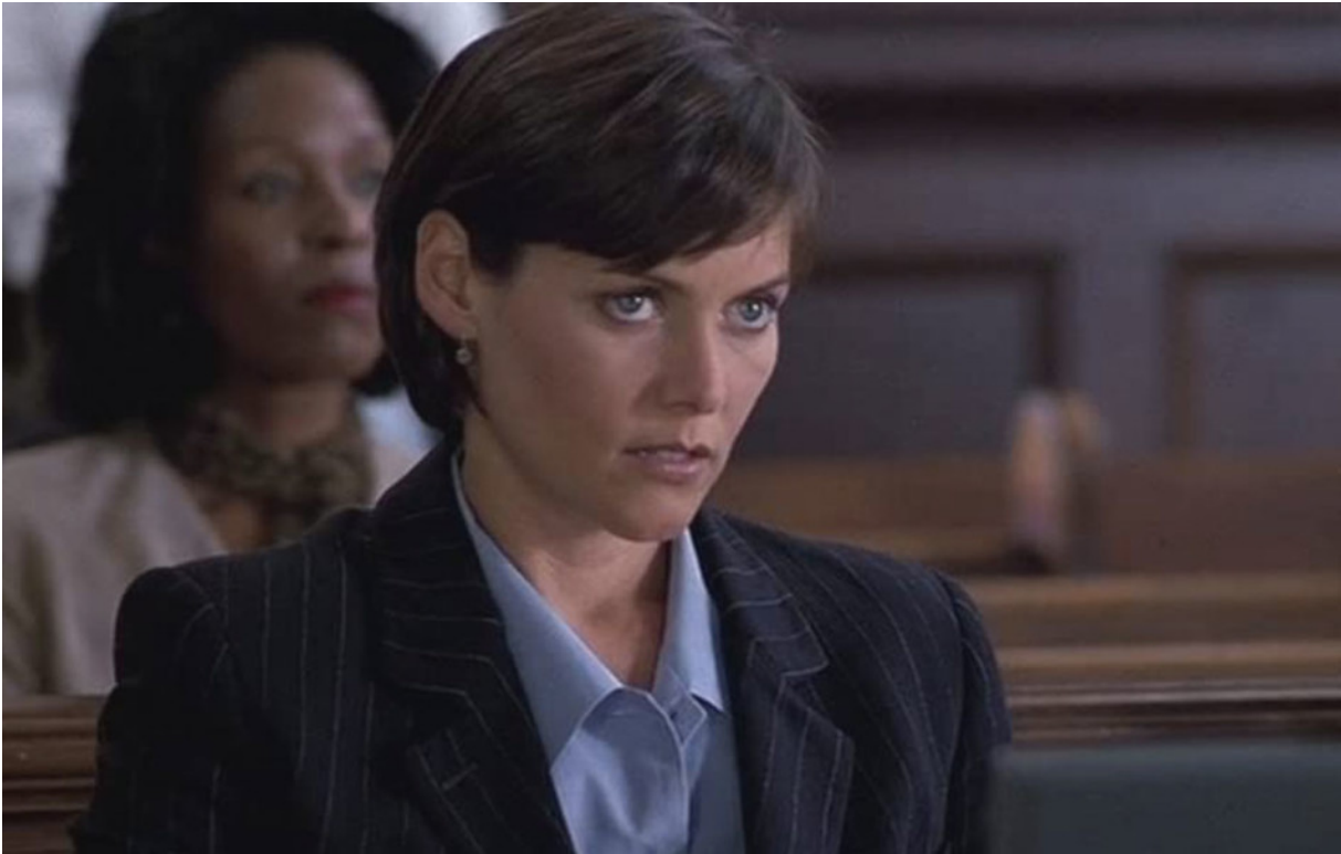
Carey Lowell in "Law & Order," NBC.

Jamie Ross (Carey Lowell) studied for the bar at Columbia before going on to serve as an assistant district attorney on Law & Order (1990–2010). In 2005, she appeared as a trial judge on the show's short-lived spin-off Law & Order: Trial by Jury