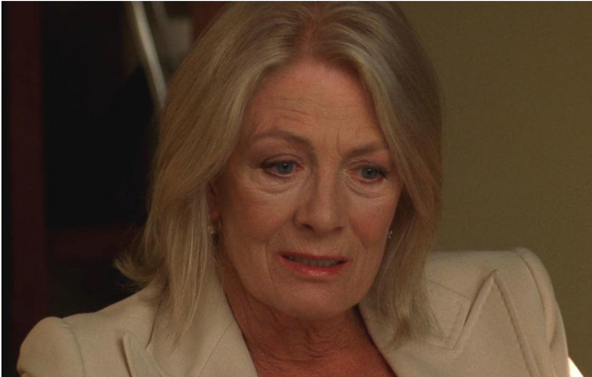
Vanessa Redgrave in "Nip/Tuck," FX.

Vanessa Redgrave had a recurring role on Nip/Tuck (2003–2010) as Erica Noughton , a psychologist with a PhD from Columbia.