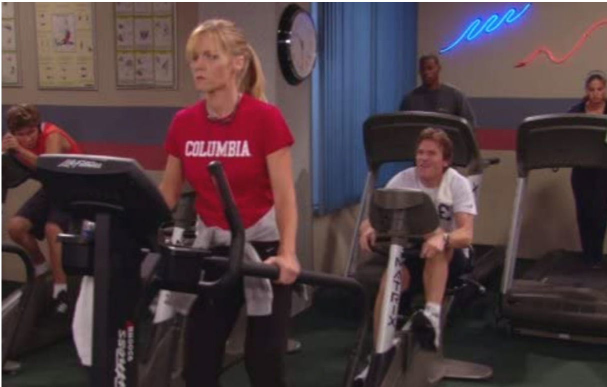
Jennie Garth in "What I Like About You," WB.

Public-relations professional Val Tyler (Jennie Garth) is an alum in the sitcom What I Like About You (2002–2006). Her less ambitious younger sister, Holly (Amanda Bynes), tries to follow in her footsteps but ends up skipping her Columbia admissions interview to hang out in Coney Island.