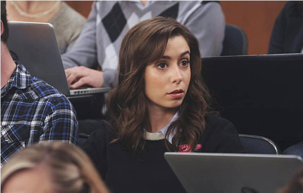
Cristin Milioti in "How I Met Your Mother," CBS.

Tracy McConnell (Cristin Milioti), the titular mother of How I Met Your Mother (2005–2014), is a former Columbia economics major.