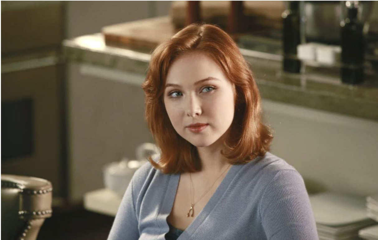
Molly C. Quinn in "Castle," ABC.

In Castle (2009–2016), mystery writer Richard Castle's daughter, Alexis Castle (Molly C. Quinn), attends Columbia for undergrad.