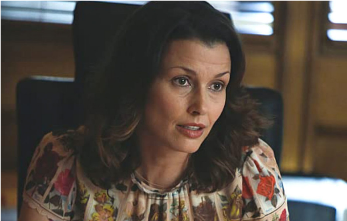
Bridget Moynahan in "Blue Bloods," CBS.

In the NYC cop drama Blue Bloods (2010–), Bridget Moynahan plays Erin Reagan , an assistant district attorney and single mother who graduated top of her class at Columbia. Reagan's daughter, Nicky Reagan-Boyle (Sami Gayle), graduates from the College in season eight.