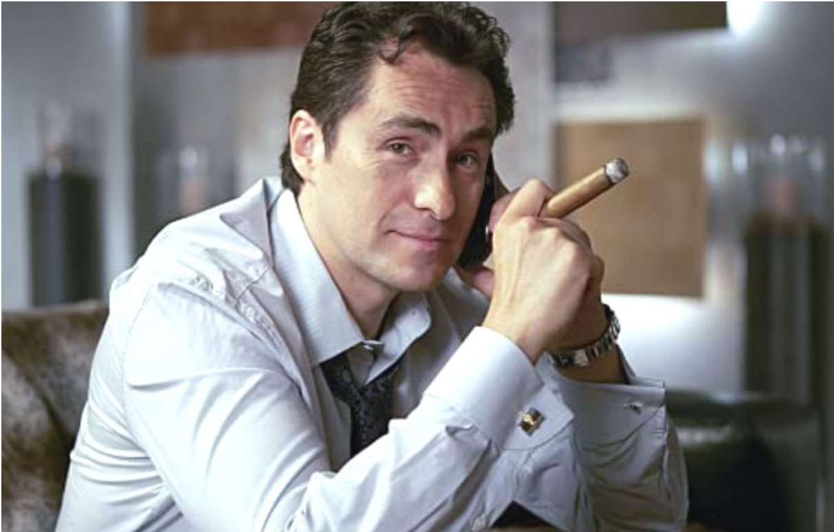
Demián Bichir in "Weeds," Showtime.

Esteban Reyes (Demián Bichir) is a drug-cartel leader who attended Columbia in Weeds , the 2005–2012 dark comedy created by Jenji Kohan '91CC.