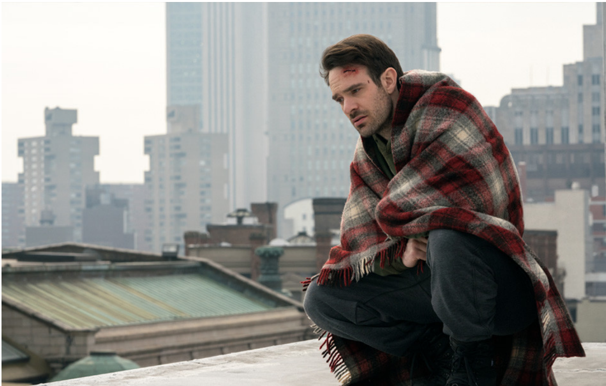
Charlie Cox as Matt Murdock in "Daredevil," Netflix.

Superhero Matt Murdock (Charlie Cox); his best friend, Foggy Nelson (Elden Henson); and ex-girlfriend, Elektra Natchios (Élodie Yung), are Columbia Law School alumni in Netflix's 2015–2018 Daredevil adaptation.