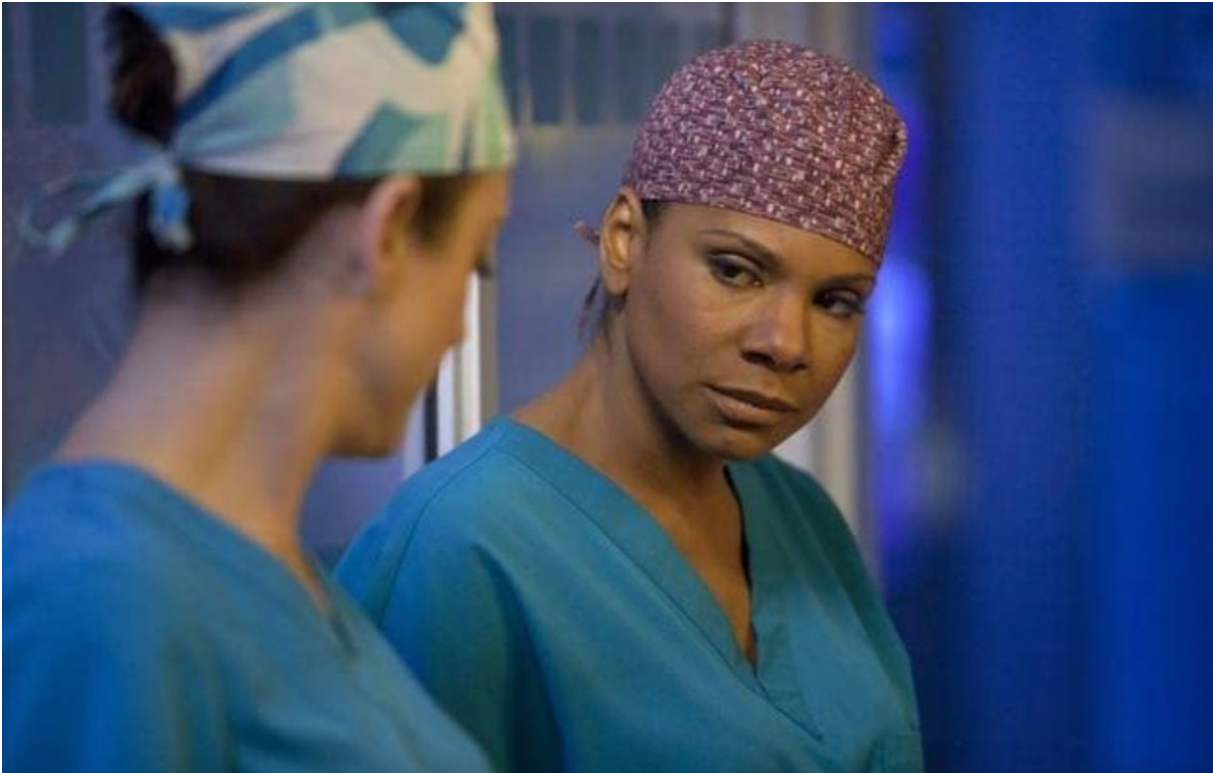
Kate Walsh (left) and Audra McDonald in "Private Practice," ABC.

Doctors and on-and-off couple Sam Bennett (Taye Diggs) and Naomi Bennett (Audra McDonald) are Columbia alumni in Private Practice (2007–2013), a Grey's Anatomy spin-off centered on Addison Montgomery.