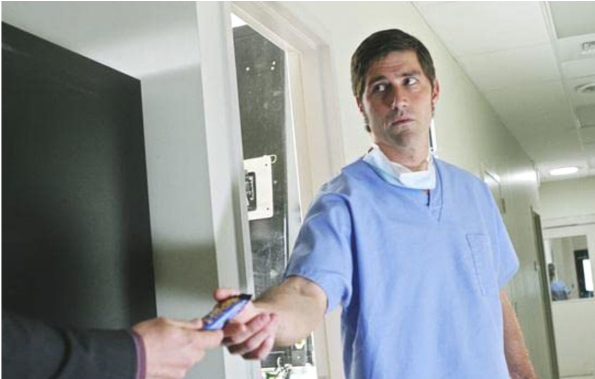
Matthew Fox in "Lost," ABC.

In the supernatural series Lost (2004–2010), real-life Columbia grad Matthew Fox '89CC plays physician Jack Shephard , a med-school alum who gets stranded on a remote island after a plane crash. (Naturally, his medical knowledge proves extremely valuable.)