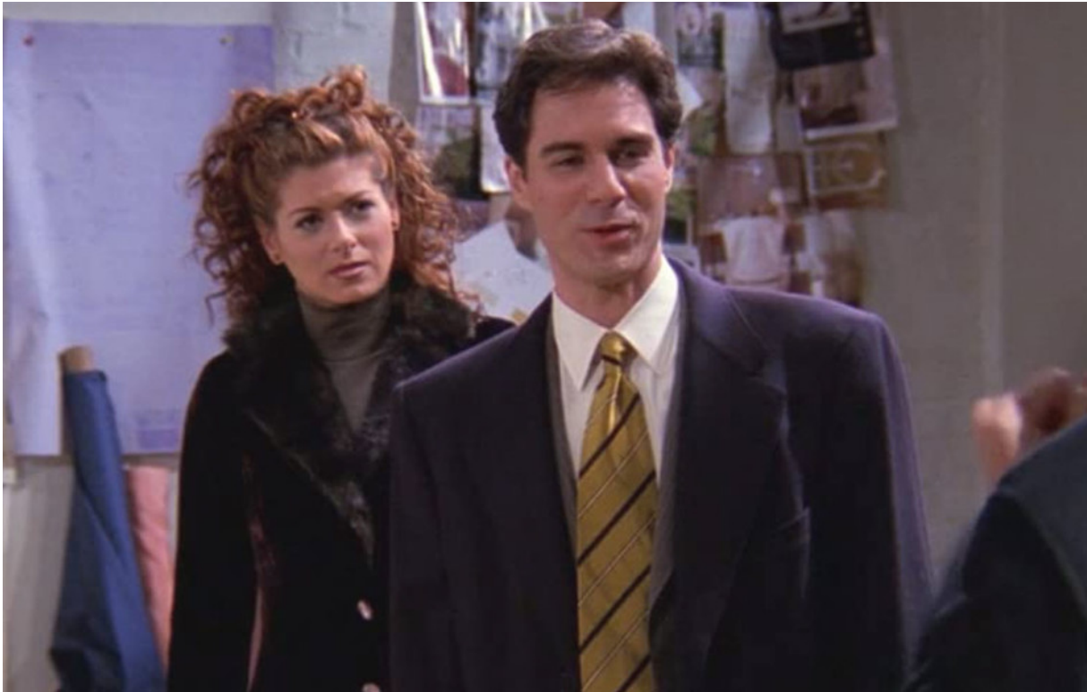
Debra Messing and Eric McCormack in "Will & Grace," NBC.

Both Will Truman (Eric McCormack) and Grace Adler (Debra Messing) of Will & Grace (1998–2020) are alumni. In fact, they began their famous friendship during their first year at Columbia.