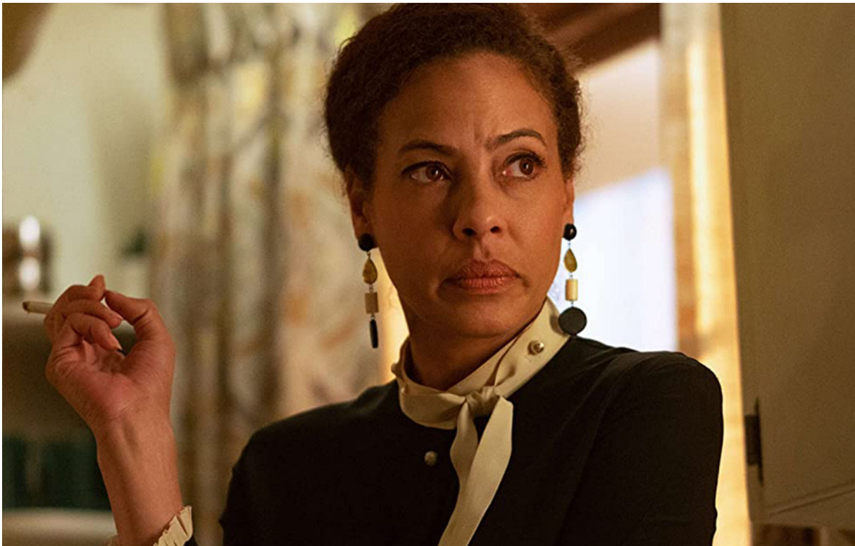
Tawny Cypress in "Yellowjackets."

New Jersey state-senate candidate Taissa Turner (Tawny Cypress) is revealed to be a Columbia Law School alumna in Yellowjackets , the 2021- series about members of a high-school soccer team who survive a plane crash.