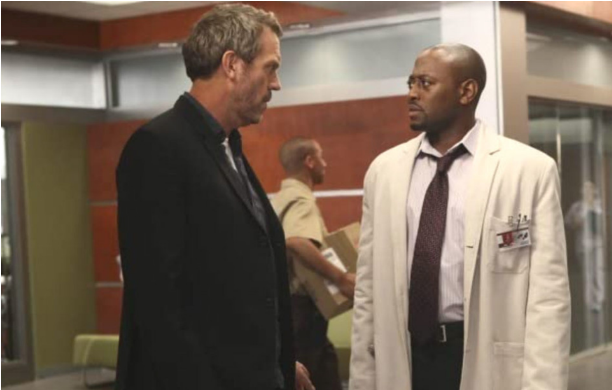
Omar Epps (right) with Hugh Laurie in "House," Fox.

While Dr. House himself didn't attend Columbia, neurologist Eric Foreman (Omar Epps) and oncologist James Wilson (Robert Sean Leonard) of the 2004-2012 medical drama House are both alumni.