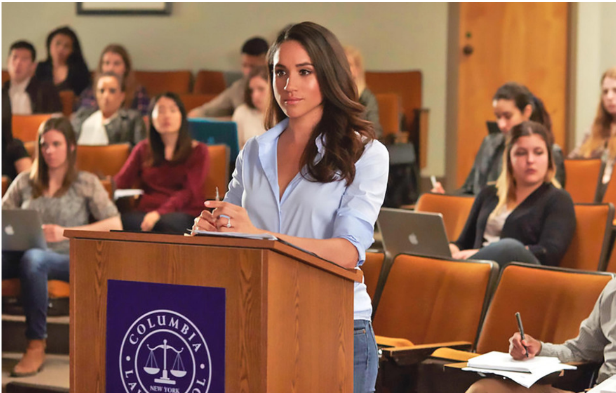
Meghan Markle in "Suits," USA.

Before she became a royal duchess and media fixture, Meghan Markle played Rachel Zane , a paralegal who attends Columbia Law School, in the legal drama Suits (2011–2019).