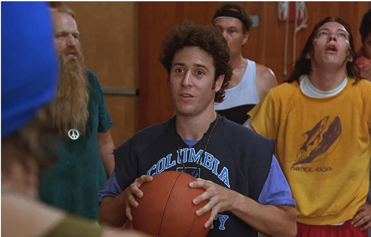
Rob Morrow in "Northern Exposure," CBS.

Queens native Joel Fleischman (Rob Morrow), another Columbia med-school alum, brings his health expertise and city sensibility to a remote Alaska town in Northern Exposure (1990-1995).