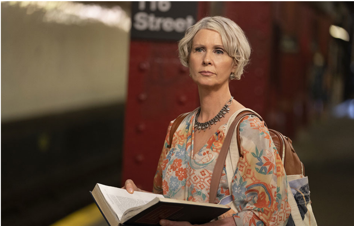
Cynthia Nixon in "And Just Like That..."

In Sex and the City (1998–2004), Miranda Hobbes (Cynthia Nixon) is a Harvard-educated corporate lawyer who makes partner at her law firm. In the series' 2021–22 spinoff, And Just Like That... , she goes back to school to pursue a master's in human rights at Columbia.