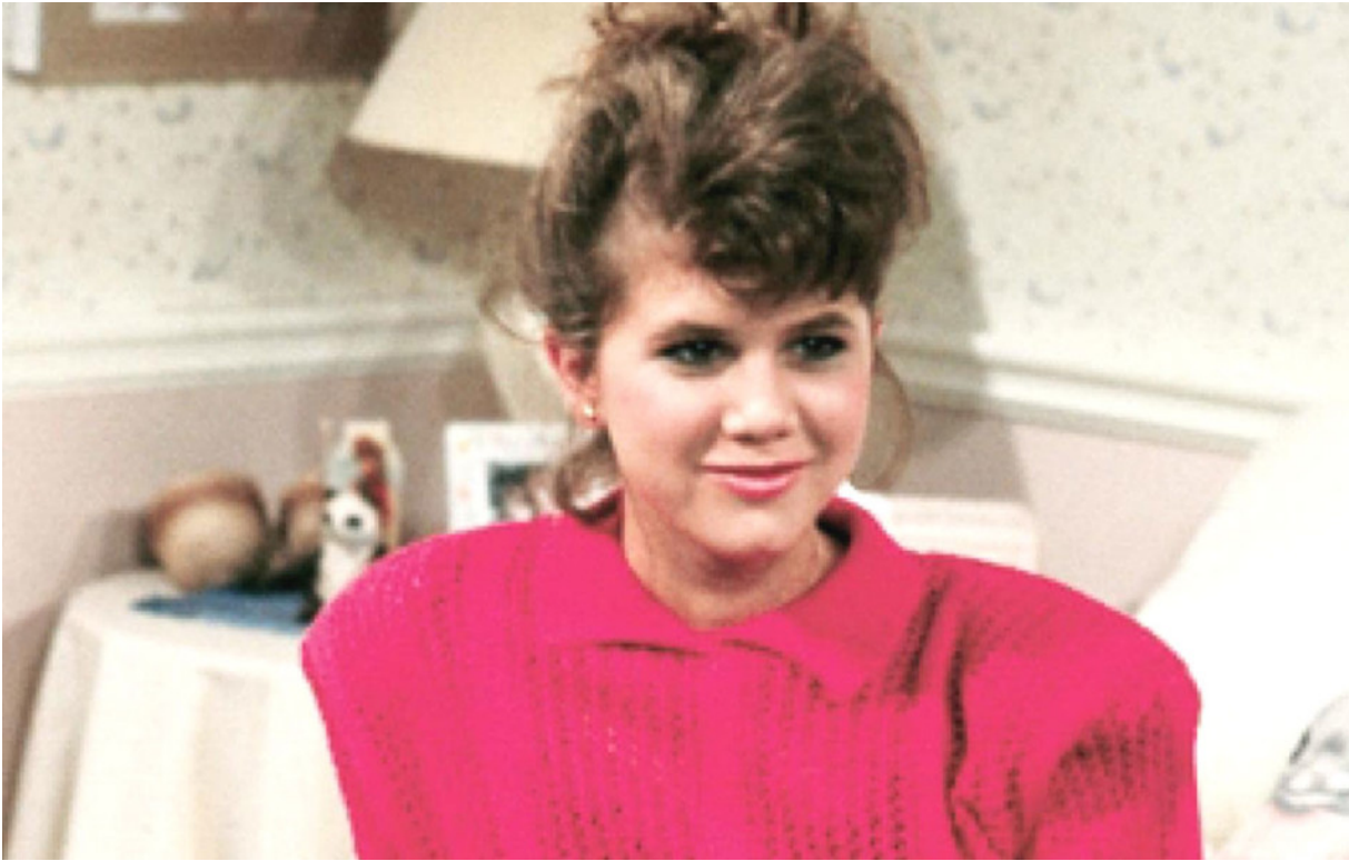
Tracey Gold in "Growing Pains," ABC.

After graduating high school with honors, Carol Seaver (Tracey Gold) of the 1985–1992 family sitcom Growing Pains goes on to attend Columbia.