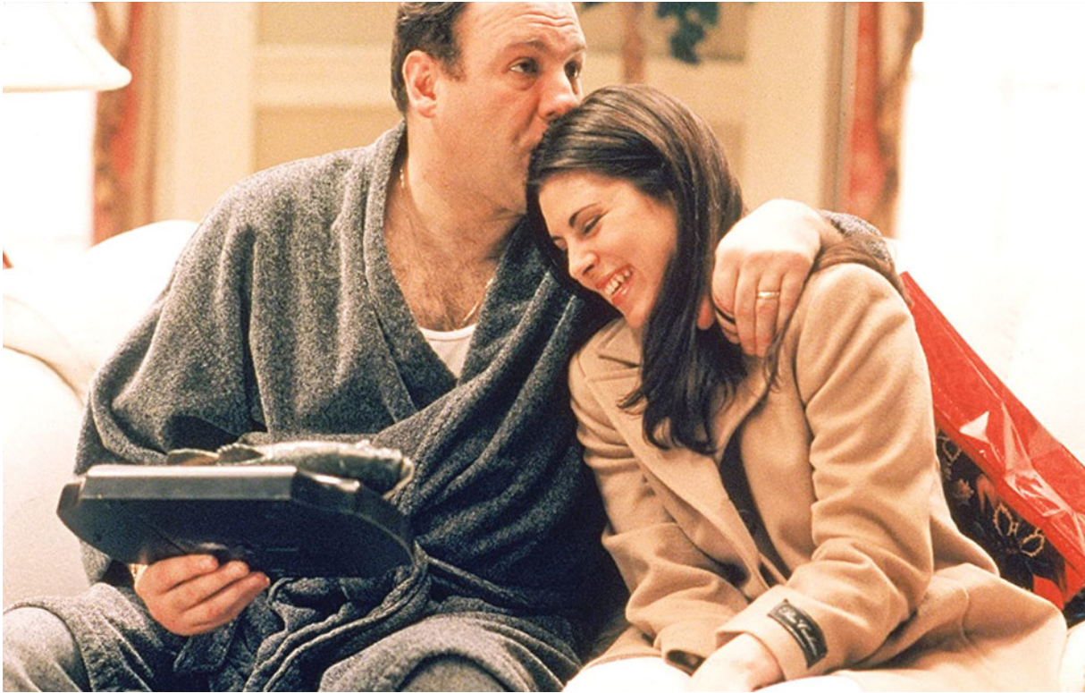
Jamie-Lynn Sigler with James Gandolfini in "The Sopranos," HBO.

In The Sopranos (1999–2007), mob princess Meadow Soprano (Jamie-Lynn Sigler) attends Columbia College and lives on campus.