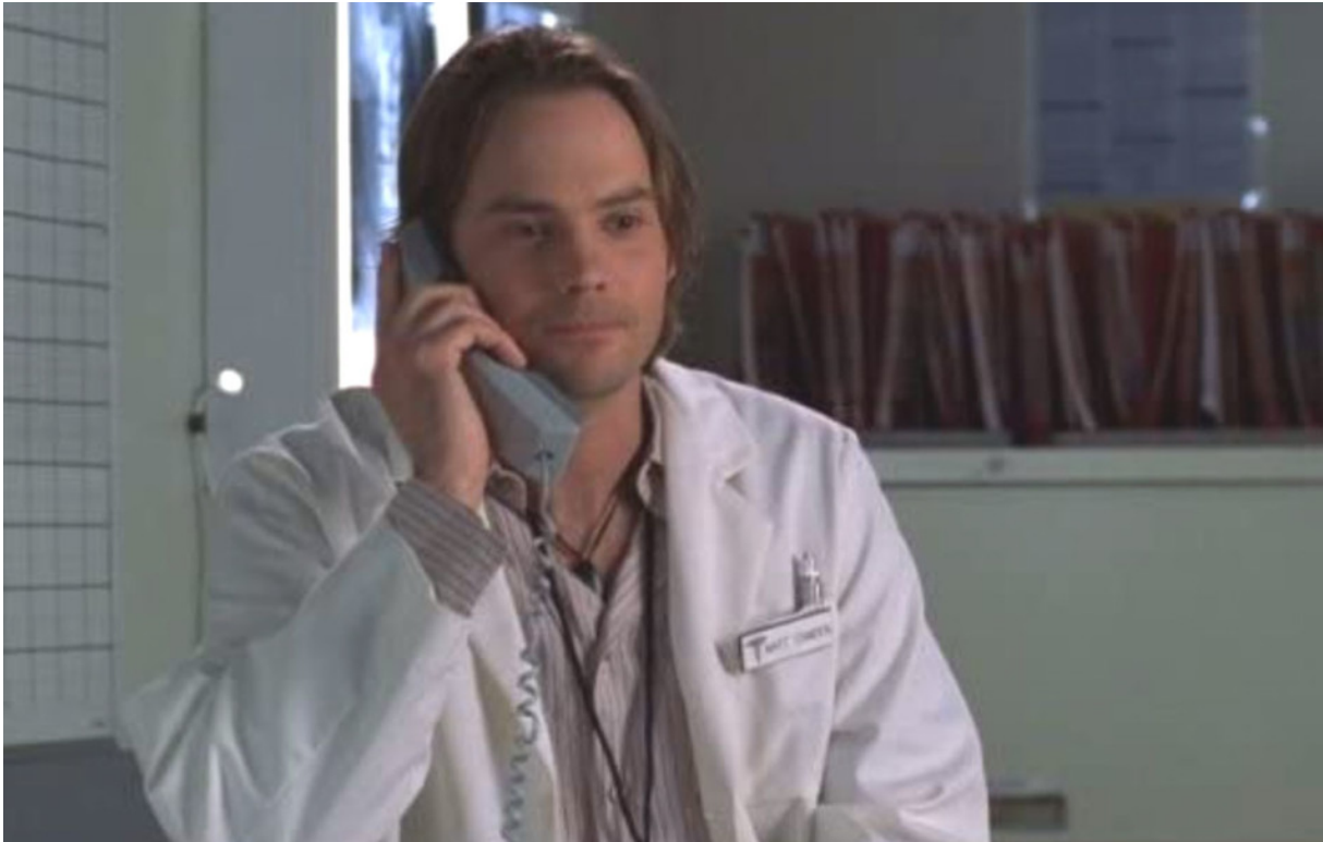
Barry Watson in "7th Heaven," WB.

Rising doctors Matt Camden (Barry Watson) and Sarah Glass Camden (Sarah Danielle Madison) attend Columbia medical school in the 1996–2006 family drama 7th Heaven .