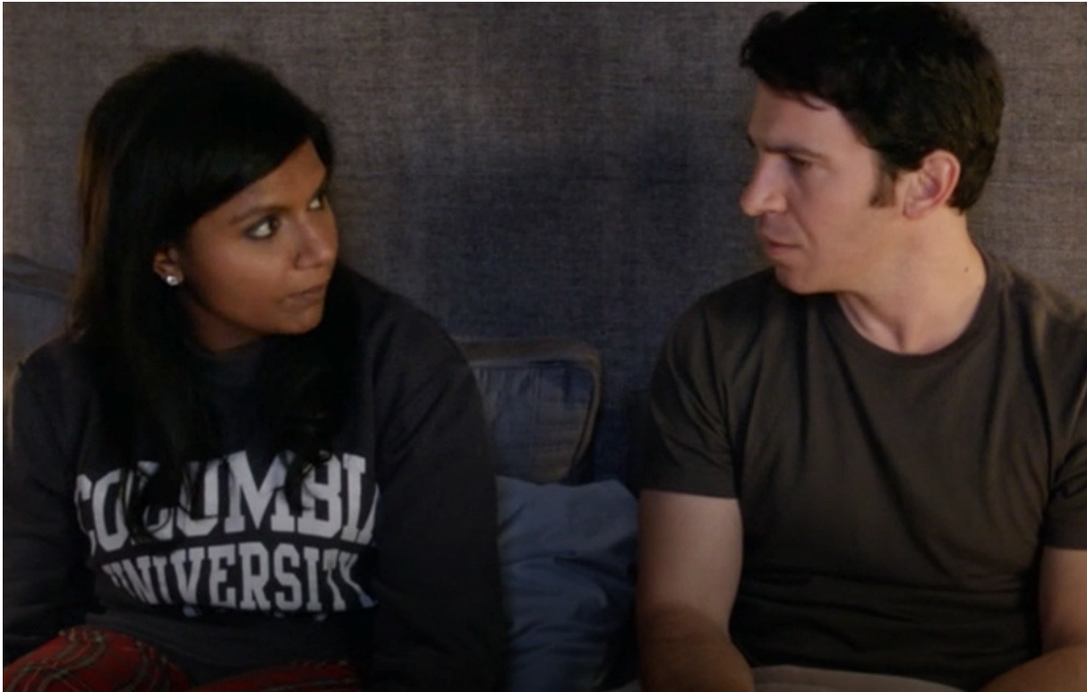
Mindy Kaling and Danny Castellano in "The Mindy Project," Fox / Hulu.

As evidenced by a shirt seen in season two, New York City OB/GYN Mindy Lahiri (Mindy Kaling) of The Mindy Project (2012–2017) is a Columbia alumna.