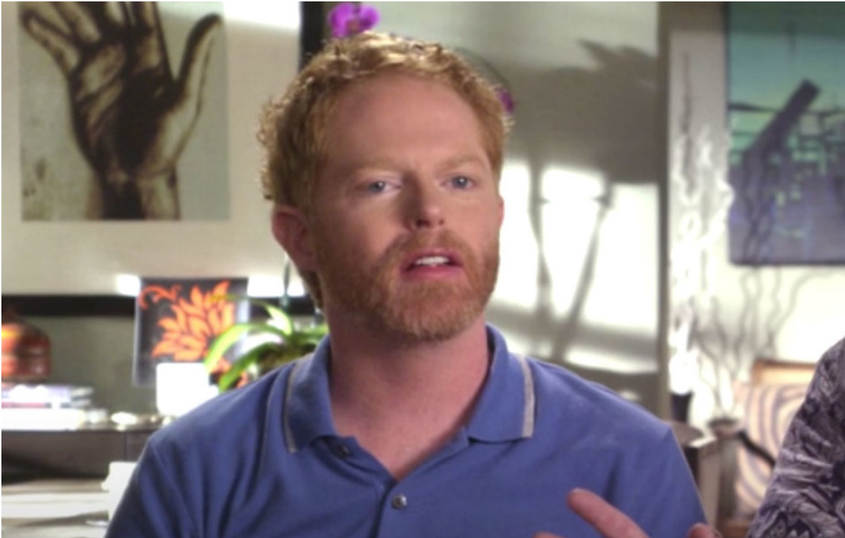
Jesse Tyler Ferguson in "Modern Family," ABC.

In Modern Family (2009–2020), Mitchell Pritchett (Jesse Tyler Ferguson) is a double Ivy League graduate, having attended both Cornell University and Columbia Law School.