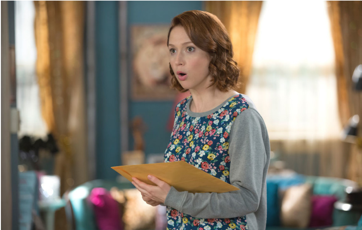
Ellie Kemper in "Unbreakable Kimmy Schmidt," Netflix.

Kimmy Schmidt (Ellie Kemper) of Unbreakable Kimmy Schmidt (2015–2019) moves to New York City after being held captive in a bunker for fifteen years. In the show's third season, she receives a Columbia scholarship but ends up flunking out.