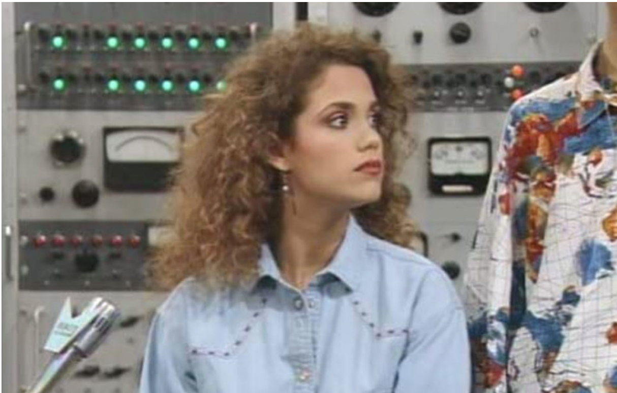
Elizabeth Berkley in "Saved by the Bell," NBC.

In Saved by the Bell (1989-1993), high-school student Jessie Spano (Elizabeth Berkley) gets rejected from her dream college, Stanford, before settling for Columbia.