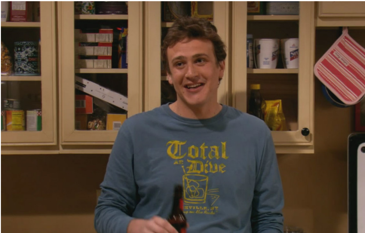
Jason Segel in "How I Met Your Mother," CBS.

Environmental lawyer Marshall Eriksen (Jason Segel) of the 2005–2014 sitcom How I Met Your Mother earned his JD at Columbia.