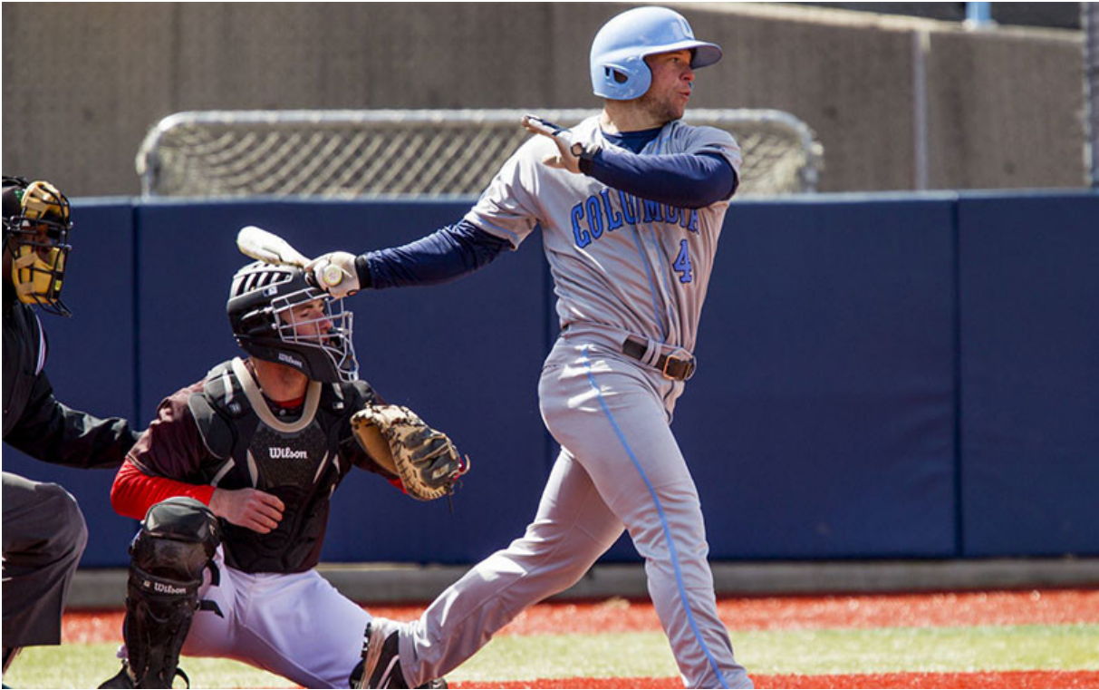
Columbia University Athletics