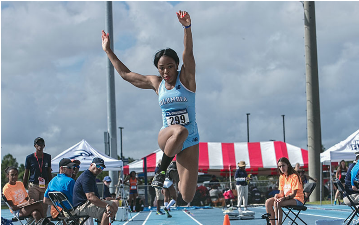
Columbia University Athletics