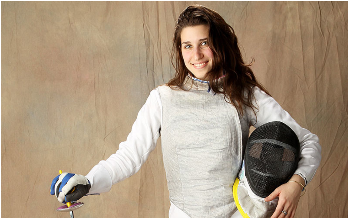
Columbia University Athletics