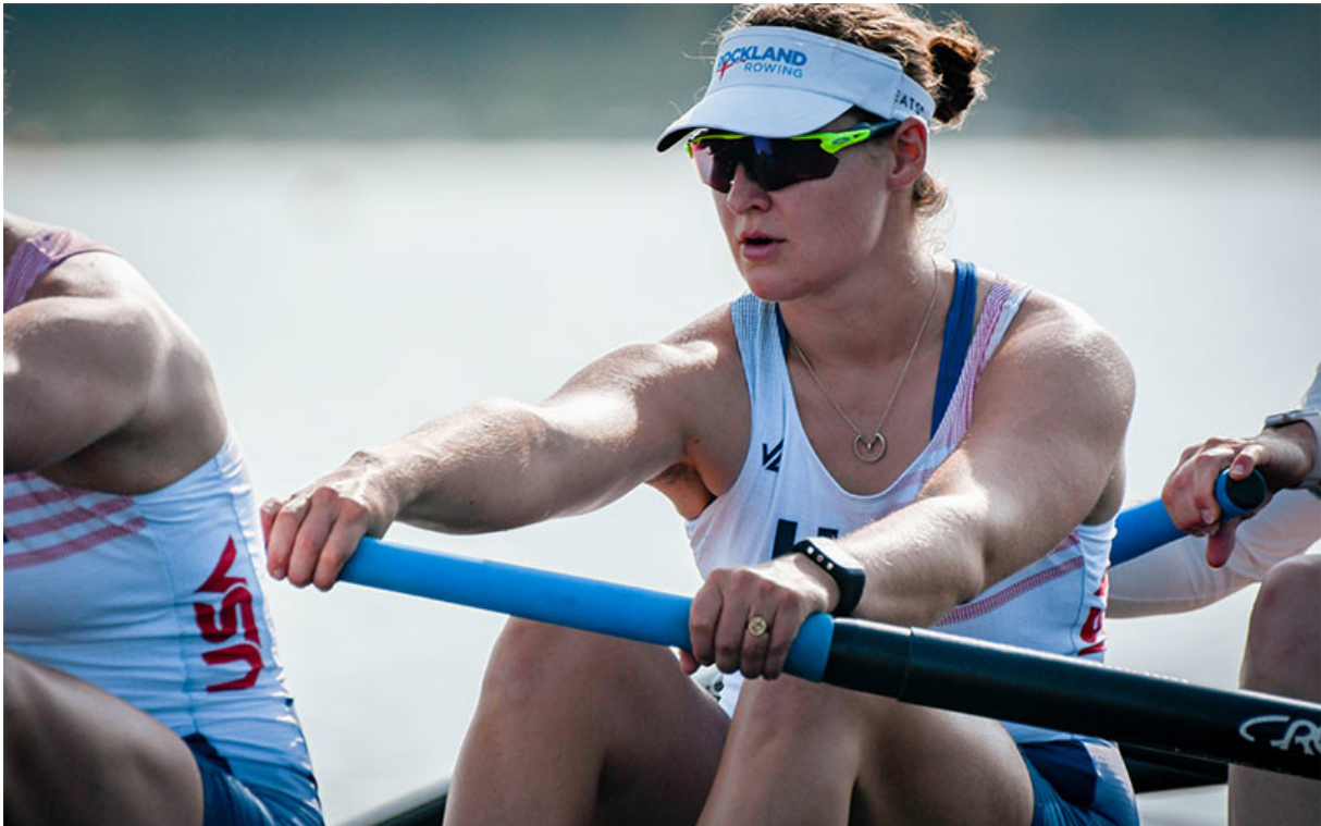
Columbia University Athletics