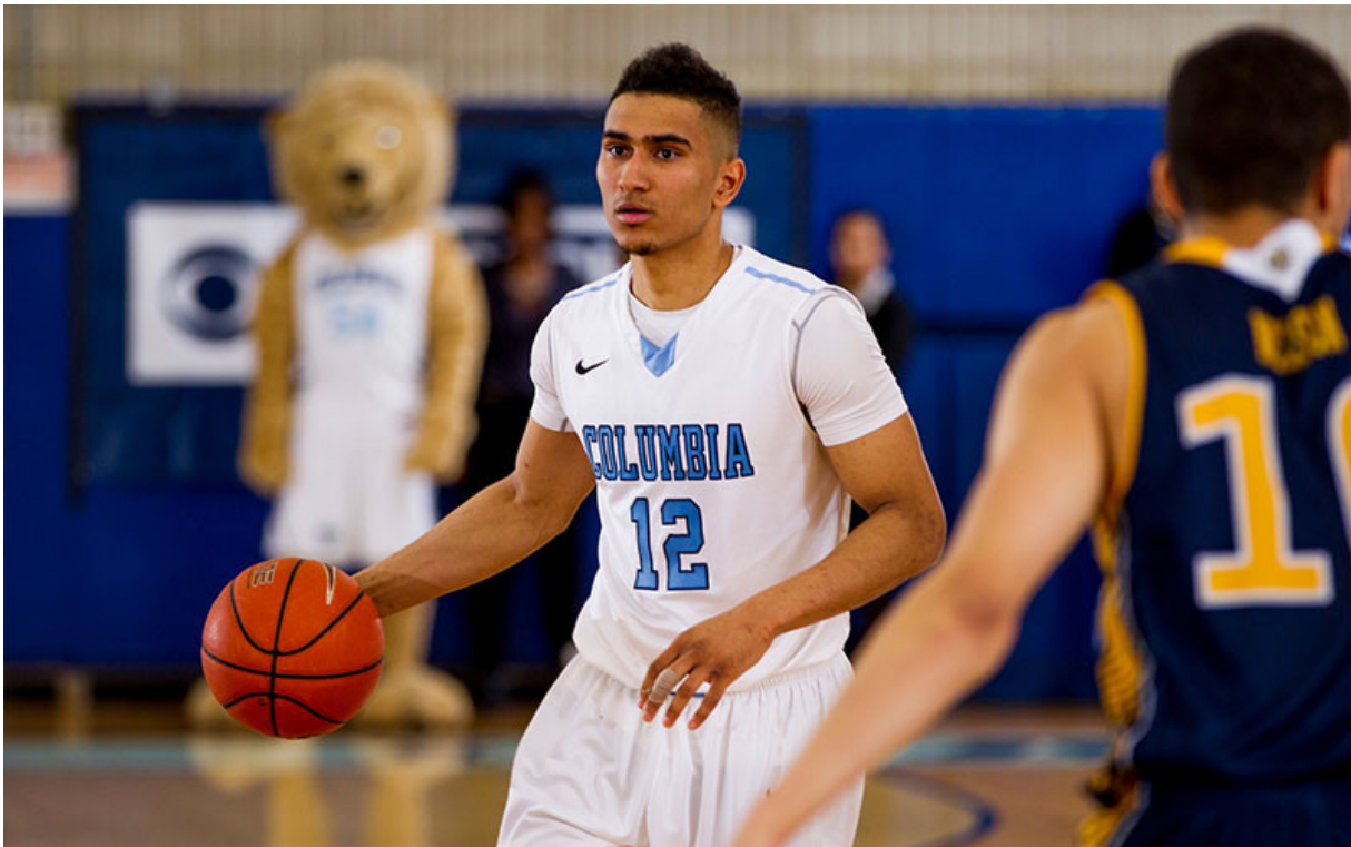
Columbia University Athletics