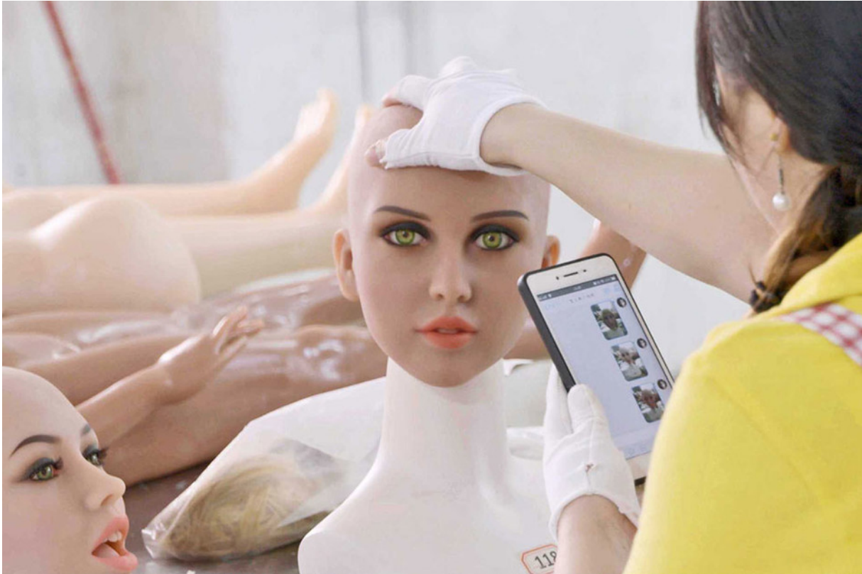
A scene from "Ascension." (Visit Films)