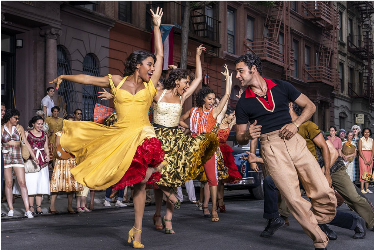
Ariana DeBose (left) in "West Side Story."

An Oscar-nominated actress known for her work in The Dark Knight , Crazy Heart , The Deuce , and other films and TV series, Maggie Gyllenhaal '99CC took on a major role behind the camera as the writer, director, and producer of The Lost Daughter . Based on the 2006 novel by Elena Ferrante, the psychological drama is up for the coveted best adapted screenplay award. Olivia Colman and Jessie Buckley, who play the older and younger versions of the protagonist, are nominated for best actress and best supporting actress, respectively. Stream on Netflix.