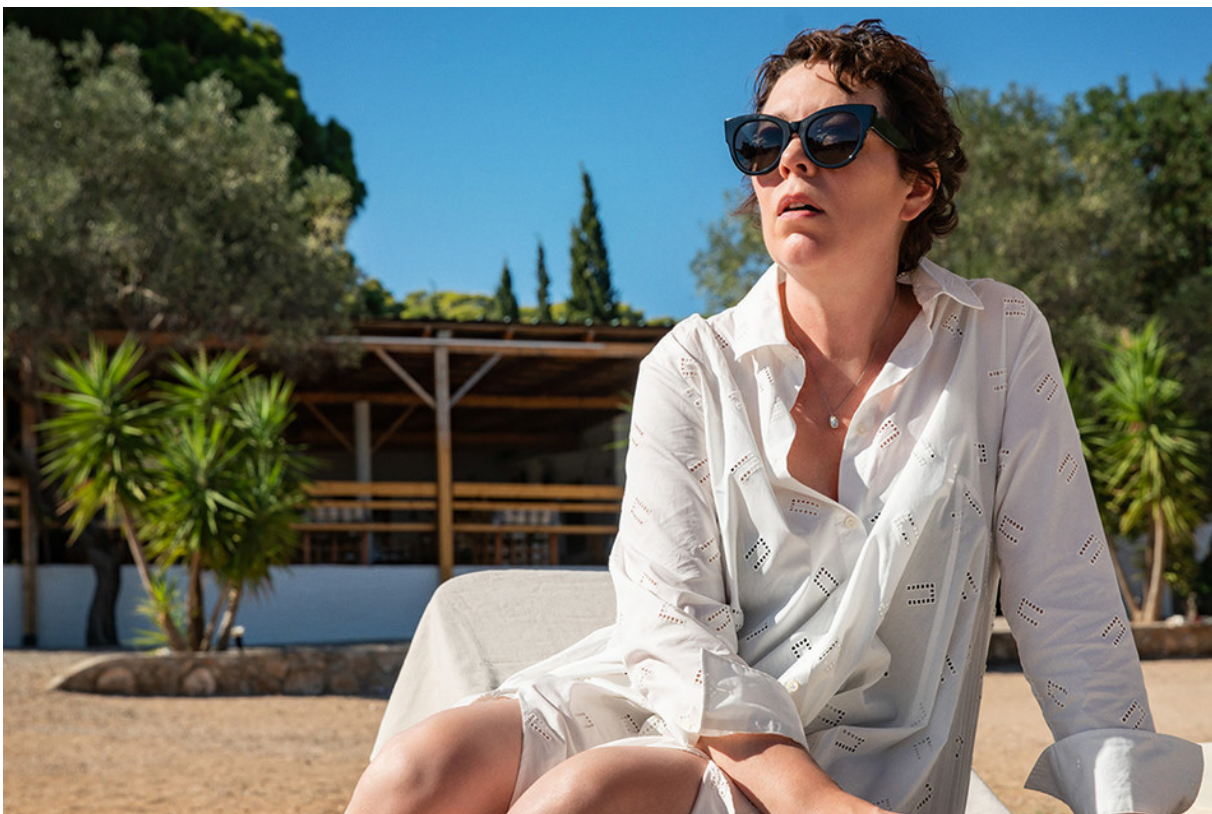
Olivia Colman in "The Lost Daughter."