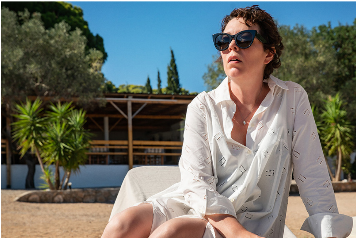
Olivia Colman in "The Lost Daughter."