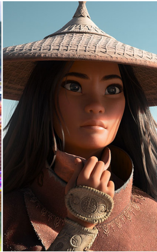
Left: "Encanto". Right: "Raya and the Last Dragon".