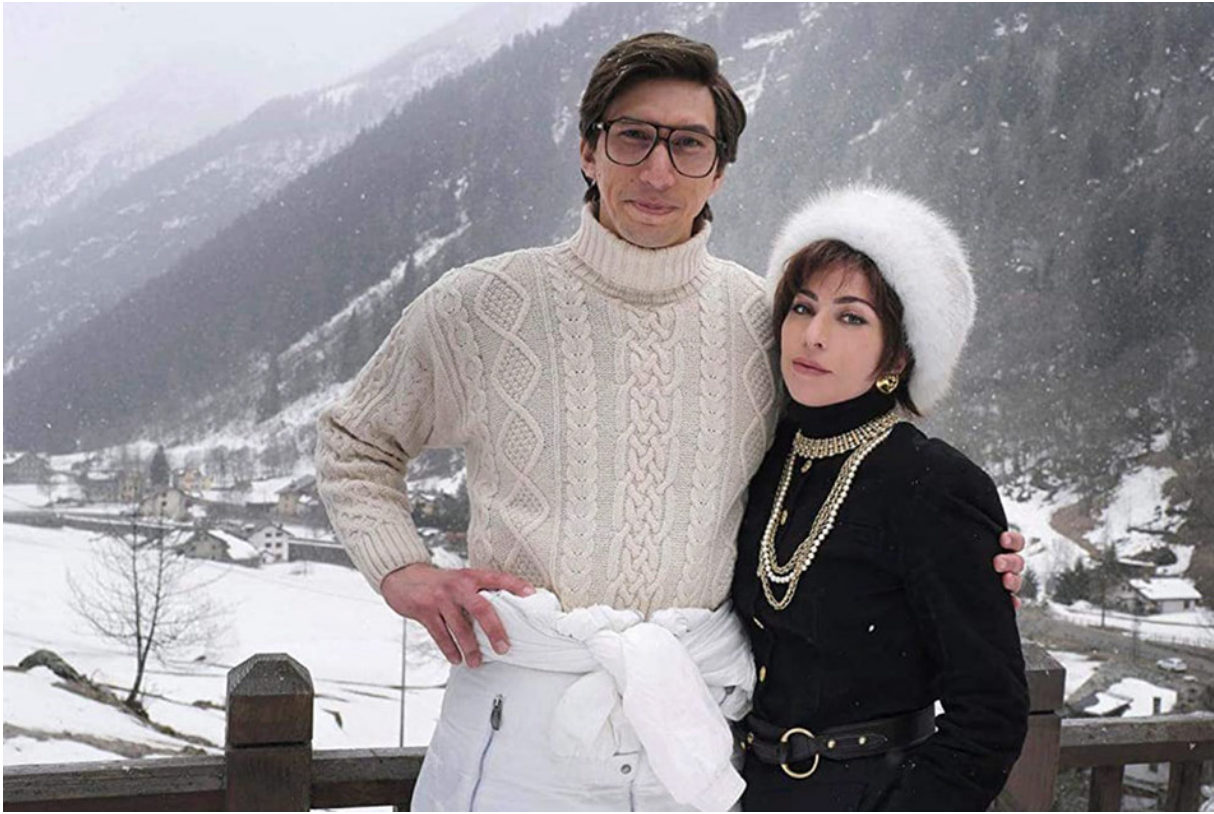
Adam Driver and Lady Gaga in "House of Gucci."