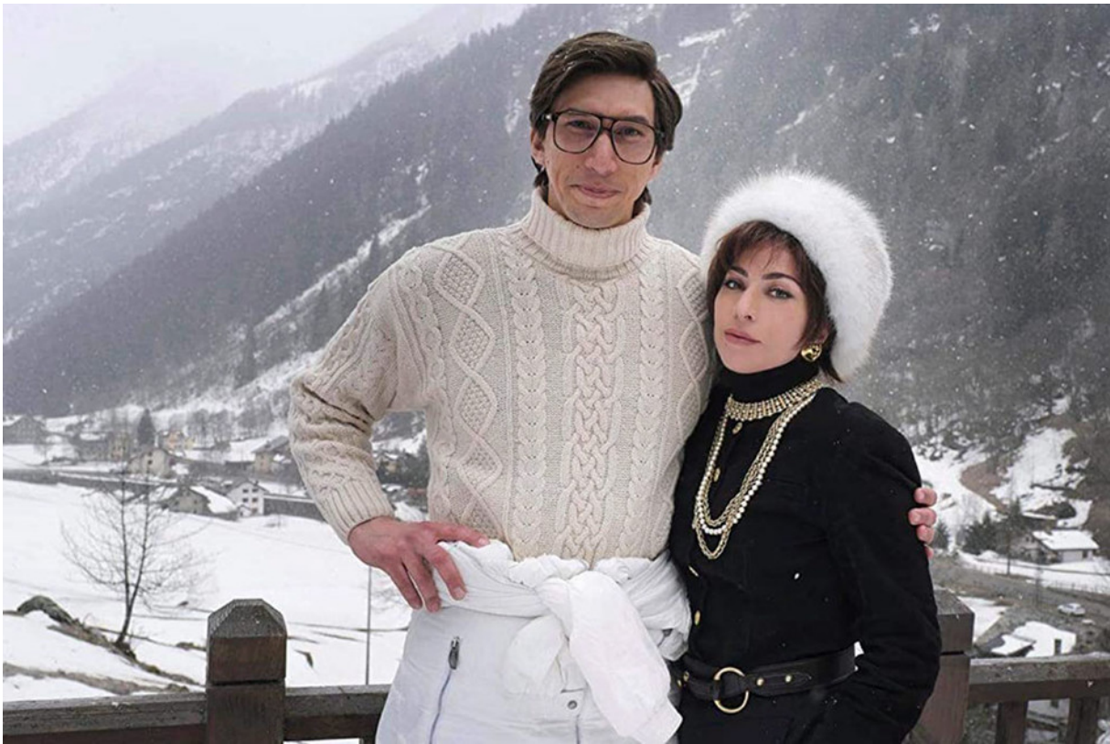
Adam Driver and Lady Gaga in "House of Gucci."