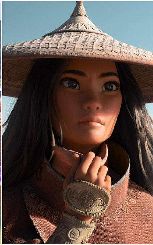
Left: "Encanto". Right: "Raya and the Last Dragon".