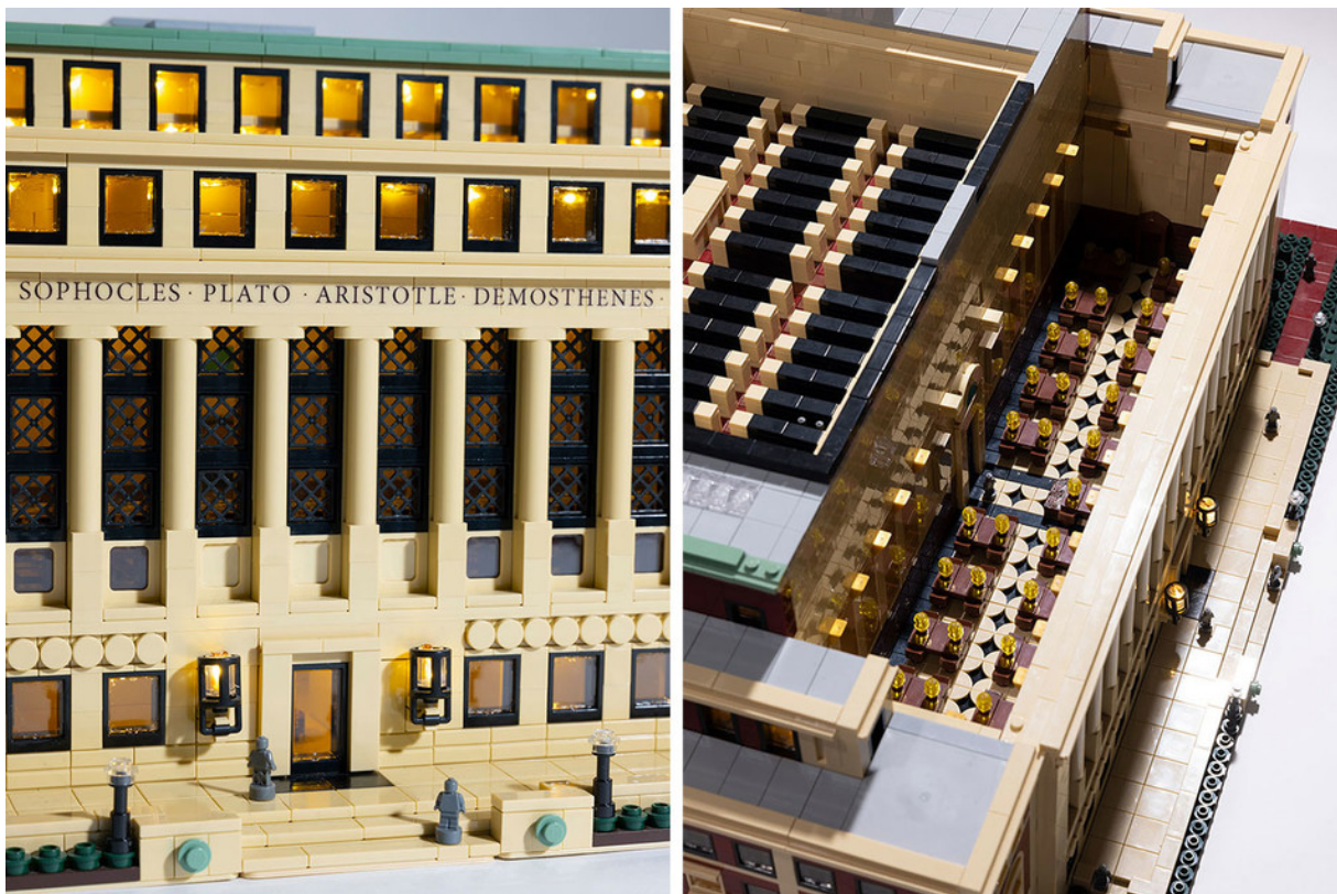
Left: Butler Library's façade. Right: the Wien Reference Room and stacks.